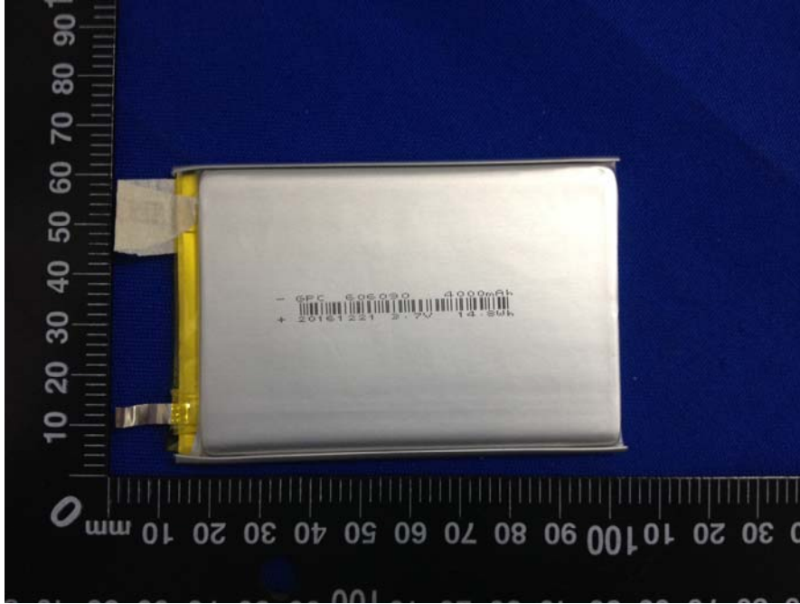
Photo 1 Front 正面