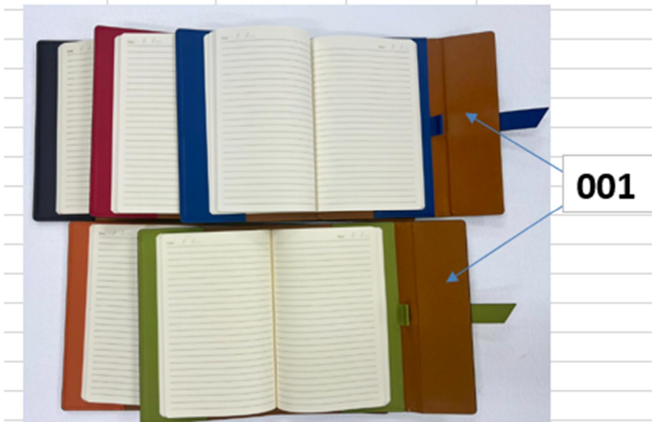
Sample 1/2/3/4/5: REFILLABLE JUNIOR PORTFOLIO