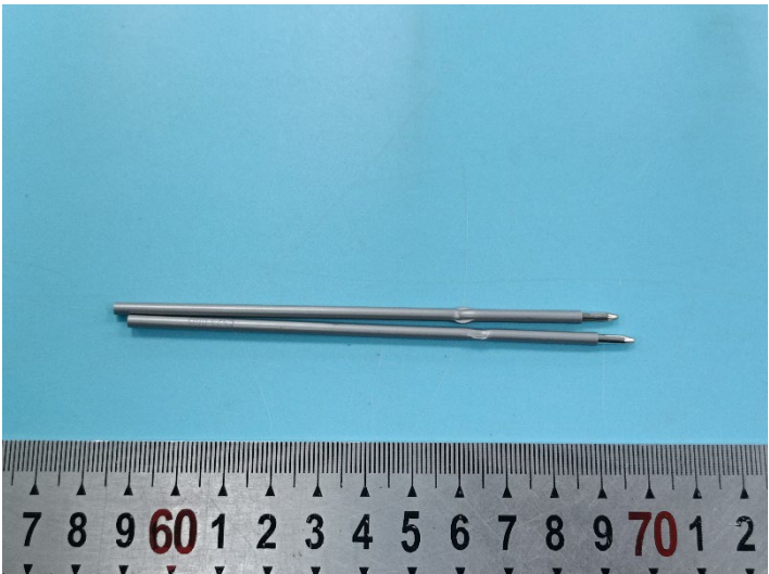
End of the report

The test result(s) and conclusion(s) in this report relate only to the sample(s) as received and the method /regulation section(s) tested as described herein. If it is not further specified in the report, the decision rule for stating conformity is based on the QIMA decision rule. (<a href="https://www.qima.com/conditions-of-service#decisionRule">https://www.qima.com/conditions-of-service#decisionRule</a>). This test report may not be reproduced in whole or in part, without the written approval of QIMA (Hangzhou) Testing Co., Ltd.