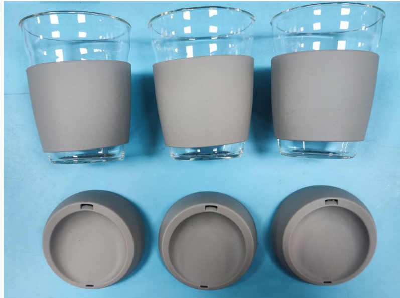
Photo before Dishwasher Safe Test