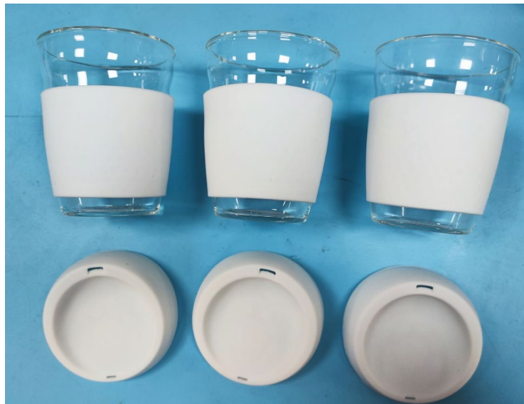
Photo before Dishwasher Safe Test