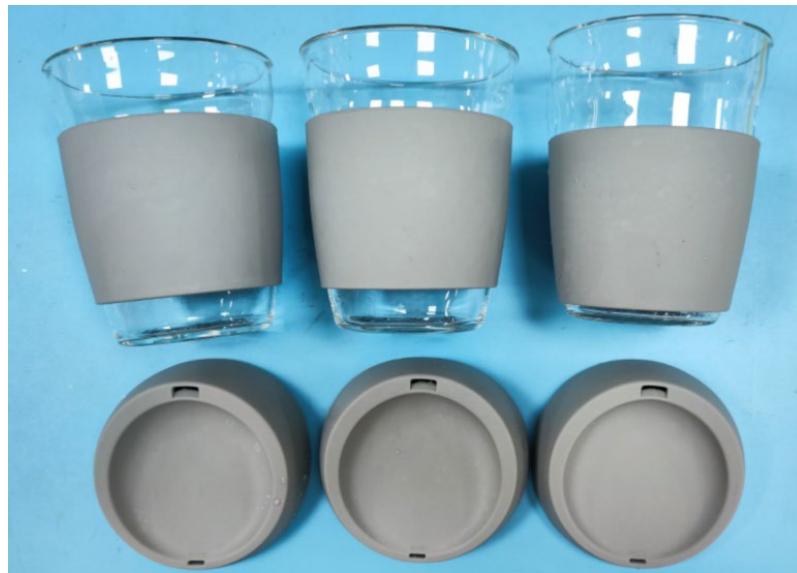
Photo after Dishwasher Safe Test