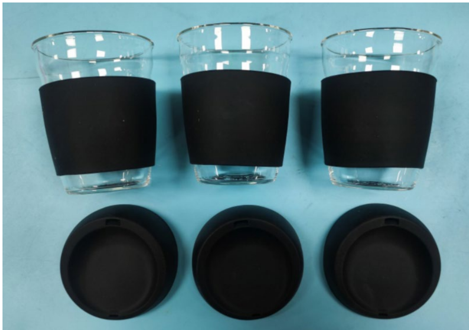
Photo before Dishwasher Safe Test