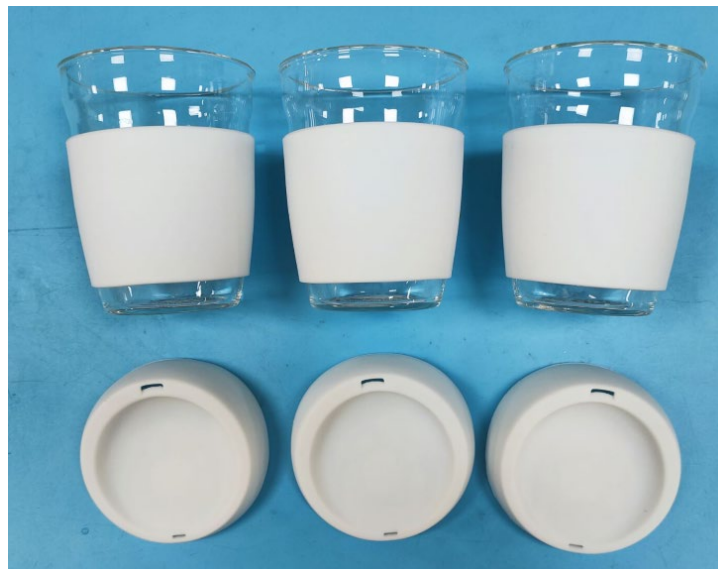
Photo after Dishwasher Safe Test