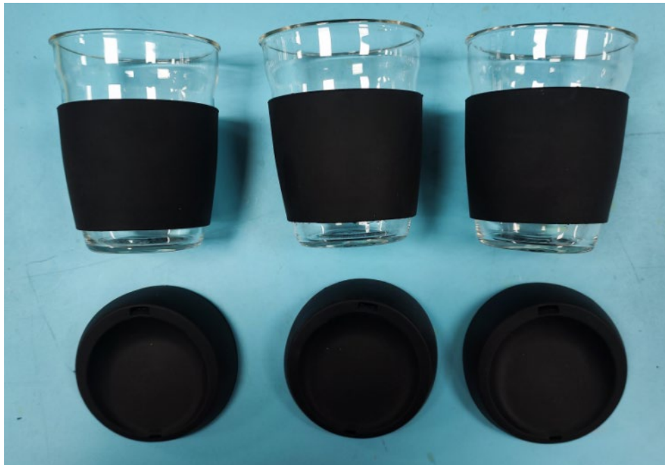
Photo after Dishwasher Safe Test