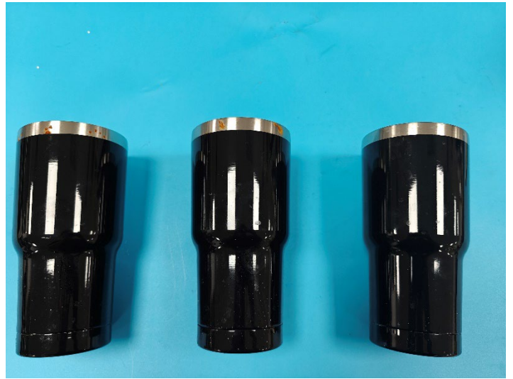
After Salt Spray Test(P02)