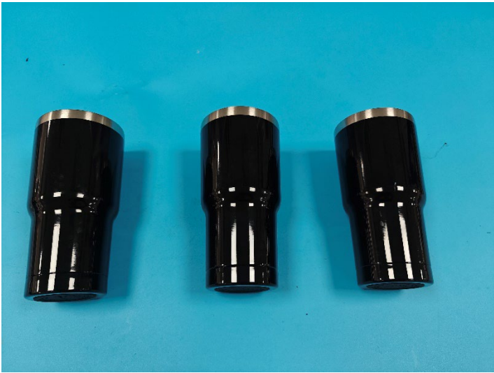
Before Salt Spray Test(P01)