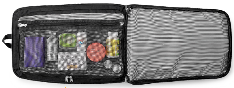
Toiletries/work essentials compartment