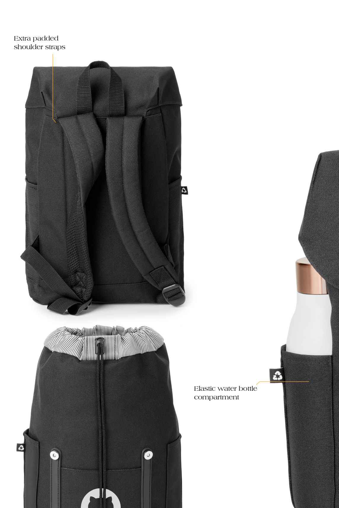
Image shown with Top Notch Reflection 600 ml Stainless Steel Bottle (DW306) and Dino Ear Bud Kit (T307)