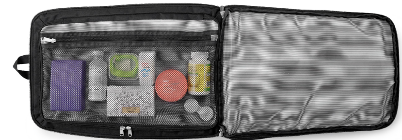
Toiletries/work essentials compartment