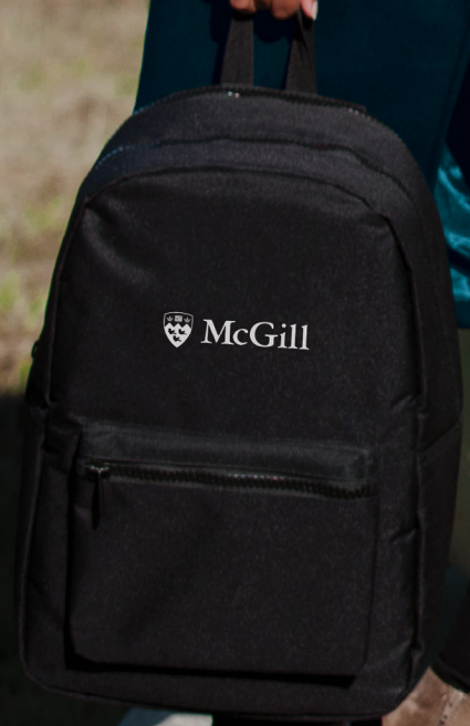
Model: Taylor Desbois, Accounts Receivable Clerk at Spector & Co. Location: Frédéric-Back Park

The Renew Insulated Tech Backpack facilitates the journey for the modern commuter! It features an insulated food storage compartment for lunch and snacks that fits four large Glasslock/Ziploc containers, or 20 cans or 4 wine bottles. It's also fitted with a completely separate padded laptop compartment to avoid food contact. It's a classic backpack silhouette with an exterior made from 100% recycled water bottles, keeping hands free of unnecessary additional bags given its multifunctionality. In front of all that is a dedicated front pocket for smaller easy-grab personal items.