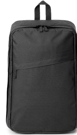
NOMAD MUST HAVES RENEW BGR100 Digital Nomad Backpack