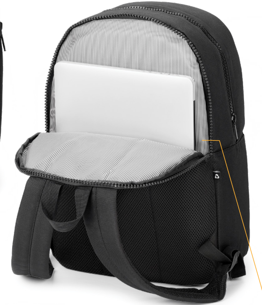
Laptop Compartment (Fits up to 15" laptop)

Insulated main compartment Fits up to 4 large Glasslock/Ziploc containers or up to 20 cans (355 ml) or 4 wine bottles (750 ml)