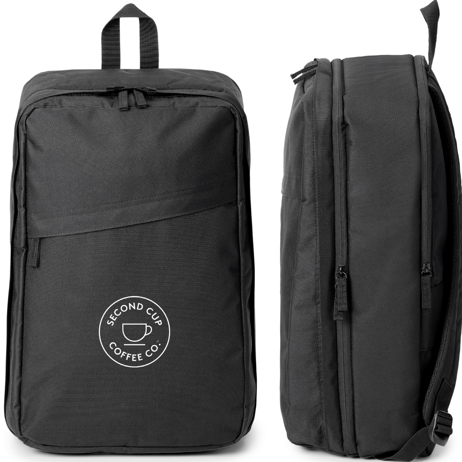
Easy grab items (large front pocket)

Product Dimensions: 12.6" x 5.9" x 18.1" Default Branding: Silk screened centered below zipper Standard Packaging: Individual plastic bag