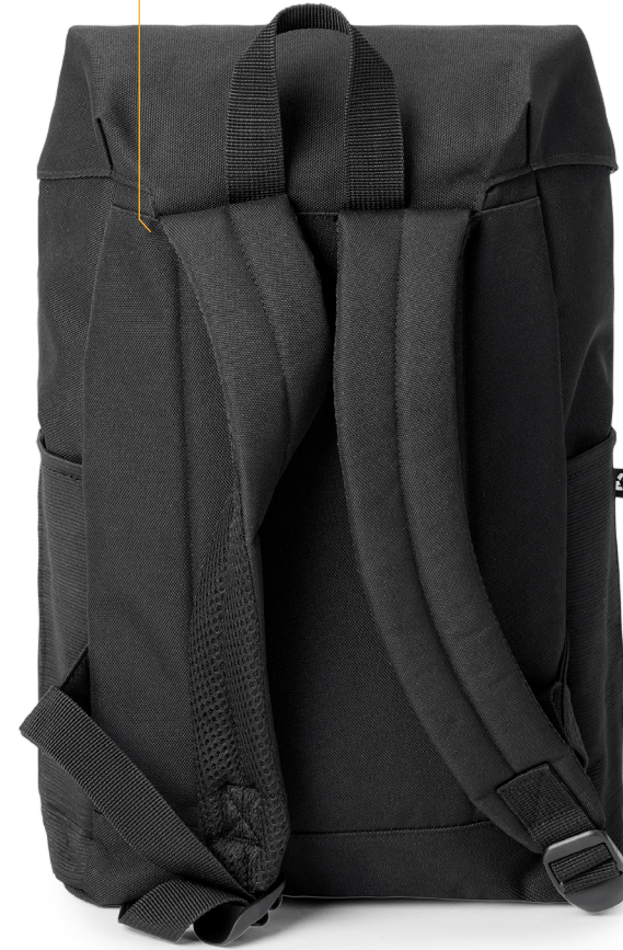
Extra padded shoulder straps