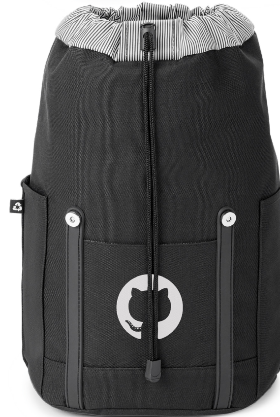
Elastic water bottle compartment