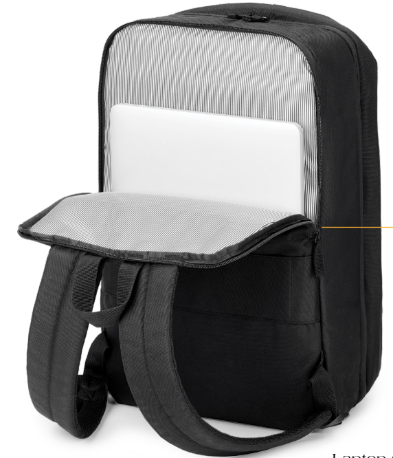
Laptop Compartment (Fits up to 15" laptop)