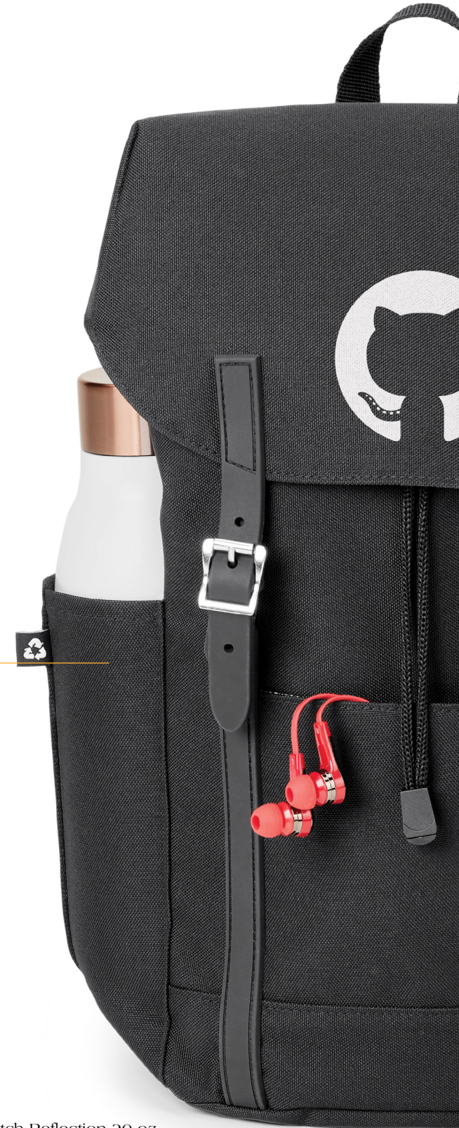
Image shown with Top Notch Reflection 20 oz Stainless Steel Bottle (DW306) and Dino Ear Bud Kit (T307)