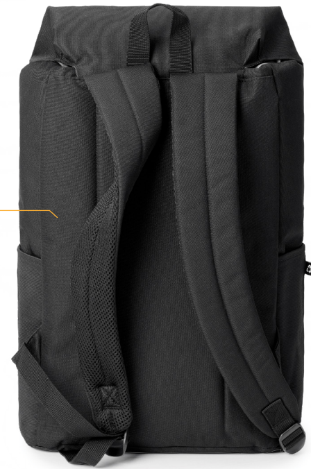
Extra padded shoulder straps