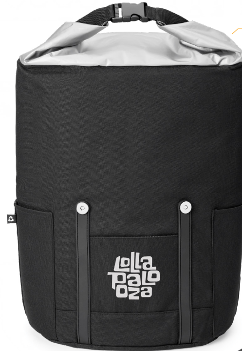
Roll top main compartment with clip closure