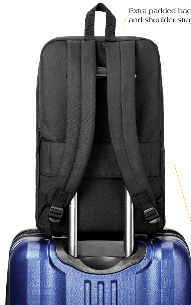
Extra padded back panel and shoulder straps