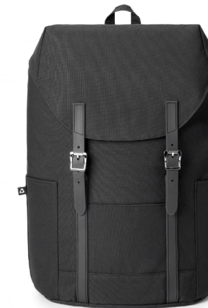
NOMAD MUST HAVES RENEW BGR102 Flip-Top Cooler Backpack