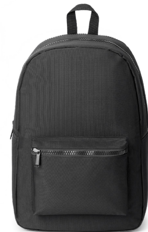
NOMAD MUST HAVES RENEW BGR103 Insulated Tech Backpack