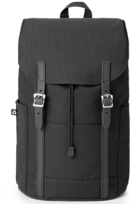
NOMAD MUST HAVES RENEW BGR101 Flip-Top Mini Backpack