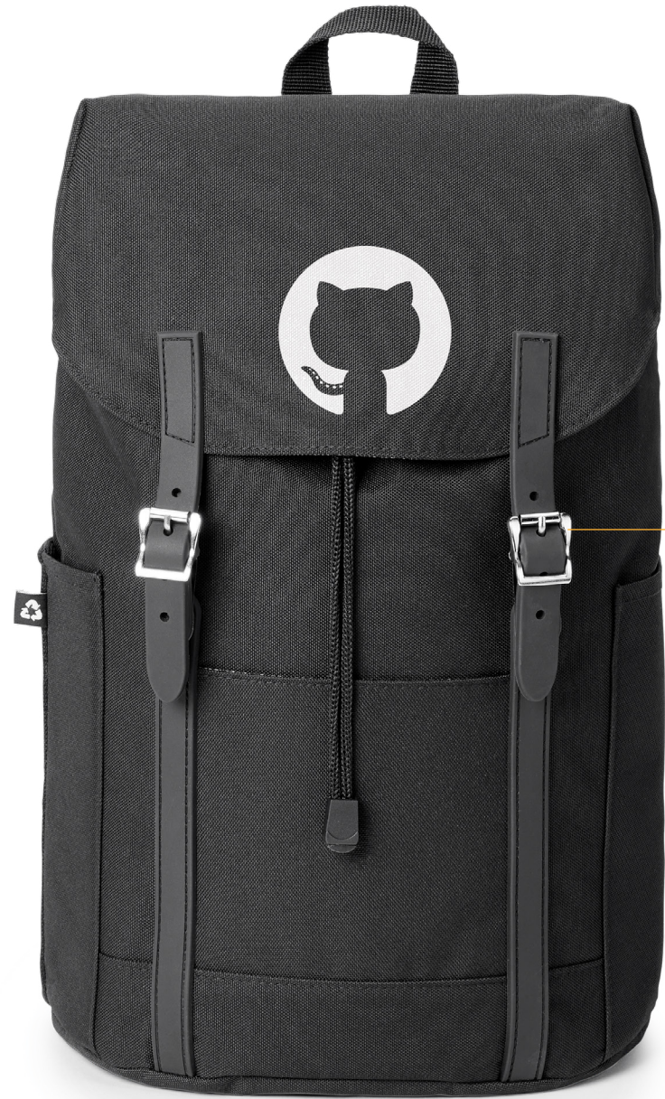
Magnetic snap buttons

Product Dimensions: 9.8" x 5.5" x 13.4" Default Branding: Silk screened centered on closing flap Standard Packaging: Individual plastic bag