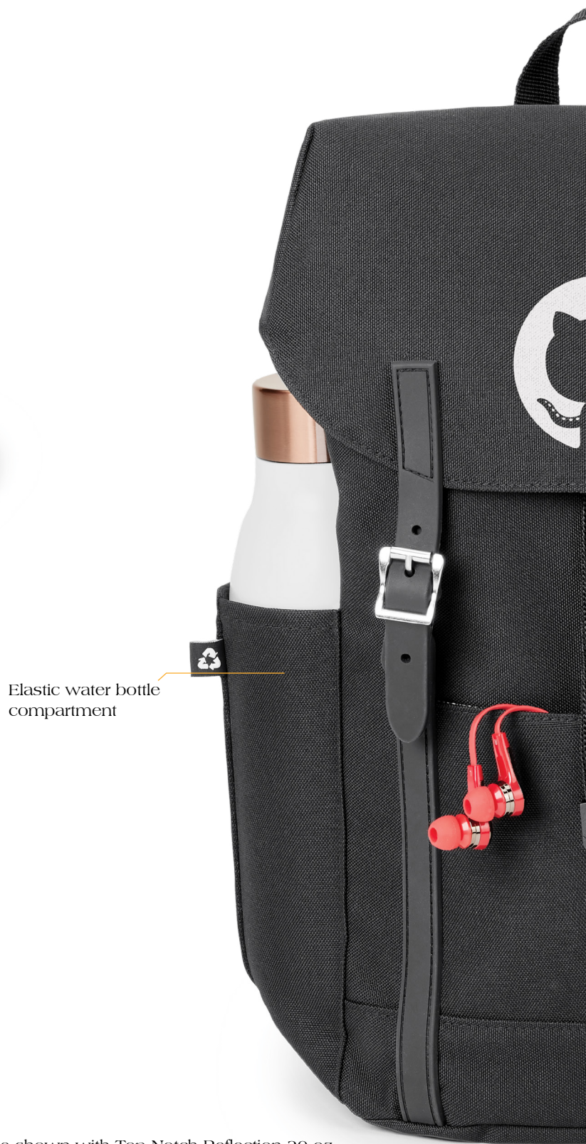
Image shown with Top Notch Reflection 20 oz Stainless Steel Bottle (DW306) and Dino Ear Bud Kit (T307)