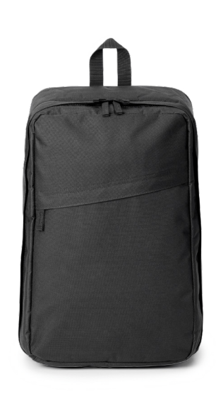
NOMAD MUST HAVES RENEW BGR100 Digital Nomad Backpack