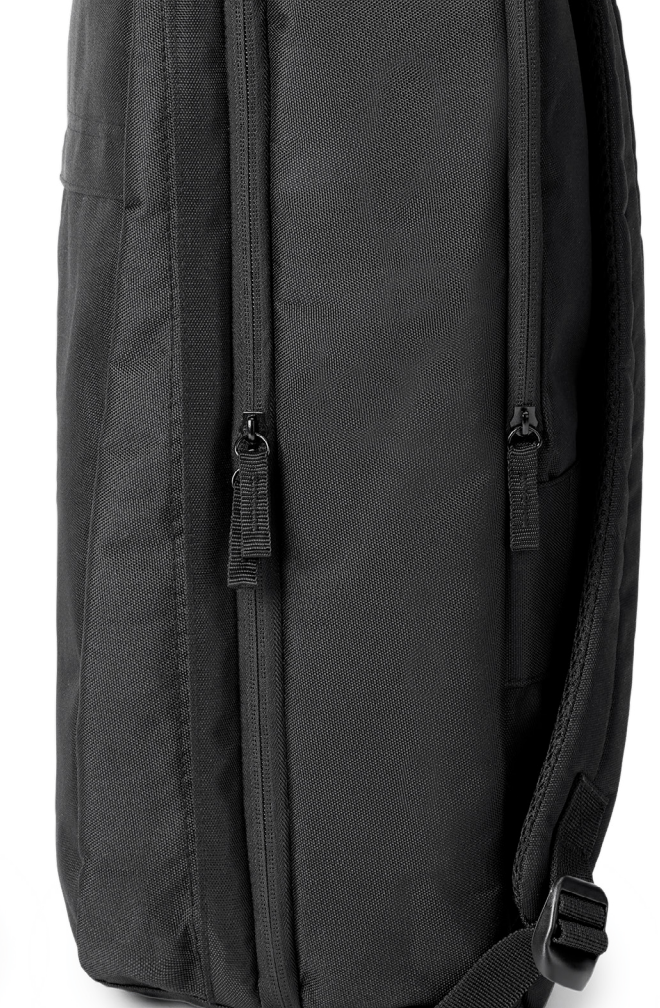
Easy grab items (large front pocket)