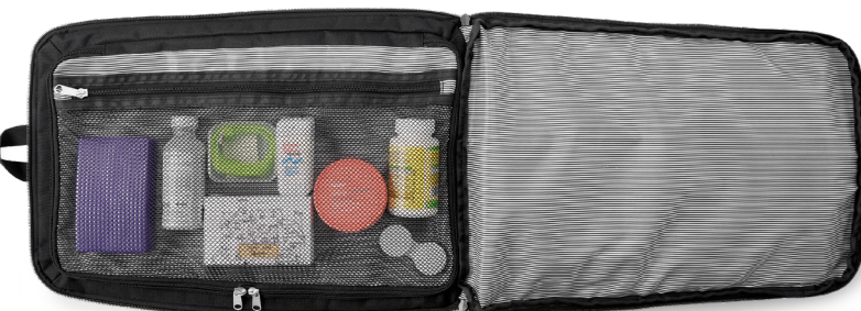
Toiletries/work essentials compartment

Extra padded back panel and shoulder straps