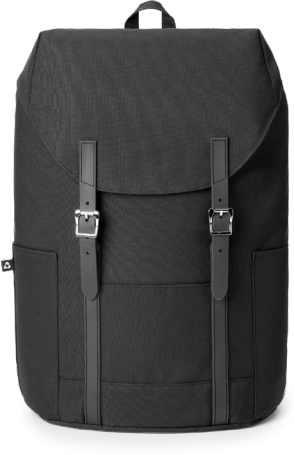
NOMAD MUST HAVES RENEW BGR102 Flip-Top Cooler Backpack