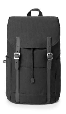
NOMAD MUST HAVES RENEW BGR101 Flip-Top Mini Backpack