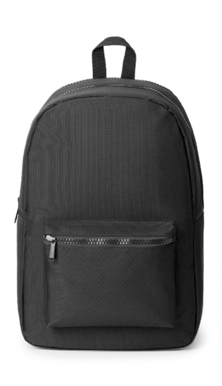
NOMAD MUST HAVES RENEW BGR103 Insulated Tech Backpack