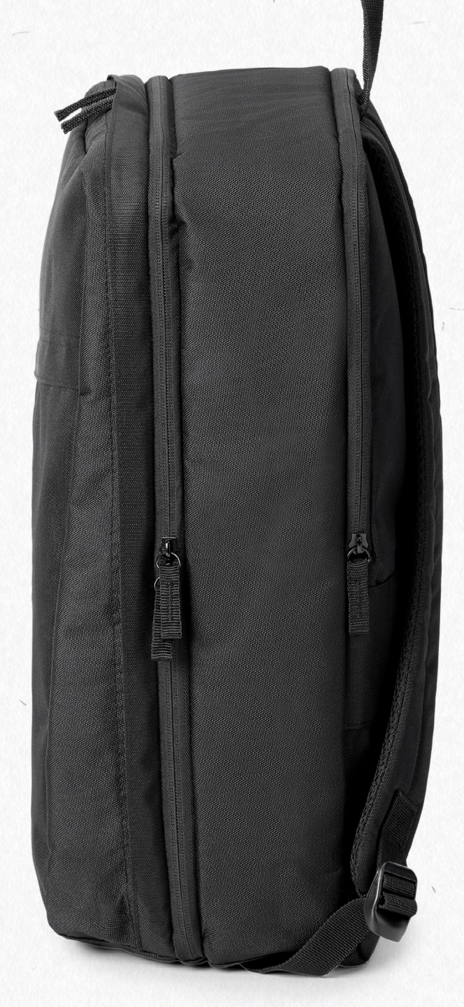
Easy grab items (large front pocket)