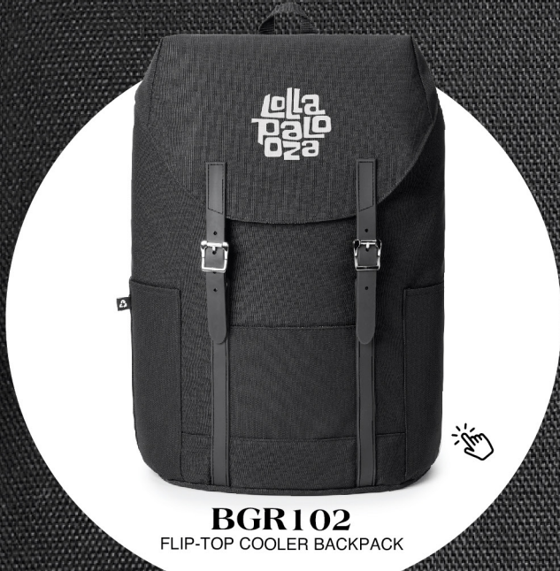
BGR102 FLIP-TOP COOLER BACKPACK