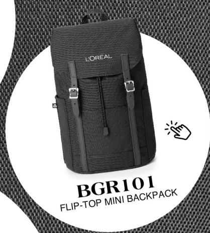
BGR101 FLIP-TOP MINI BACKPACK