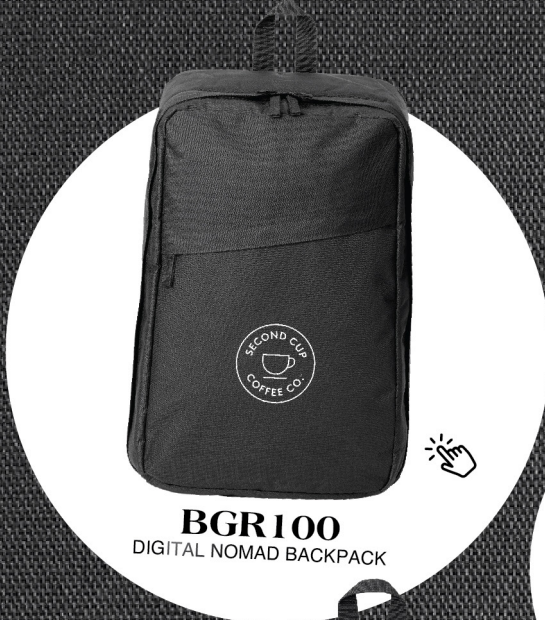
BGR100 DIGITAL NOMAD BACKPACK