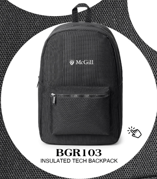
BGR103 INSULATED TECH BACKPACK